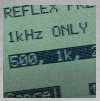
MT10 offers 4 reflex frequencies