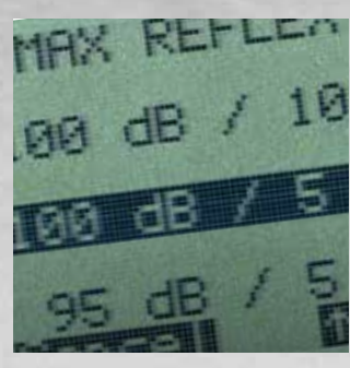
4 reflex levels are available in the optional reflex test (85-100dB)