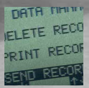
It is easy to delete, print or send records to the PC (requires the optional USB adaptor to transfer or print data).

Otitis media can be easily and quickly detected with the MT10.